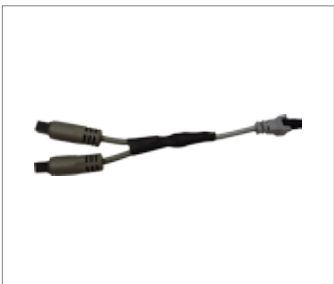
Y-Cable 4 Pin (25657)