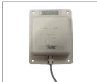
WI-FI Module (50254)