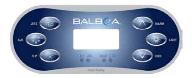
Overlay 12101 (Jets, Aux, Flip, Warm, Cool)