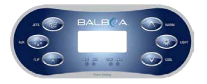
Overlay 12198 (Jet 1, Jet 2, Flip, Warm, Cool)