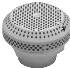
3.5" Hi-Flo Suction