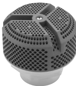
3.5" Ultra Hi-Flo Suction