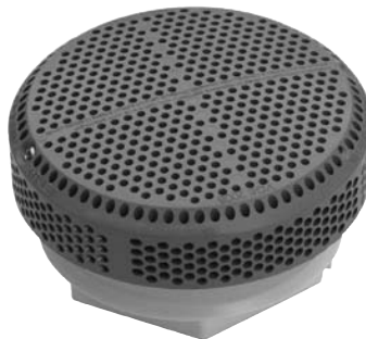
5" Super Hi-Flo Suction