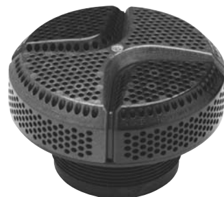
5" Designer Pro Series Suctions