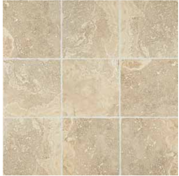
TUSCAN SUN CR15