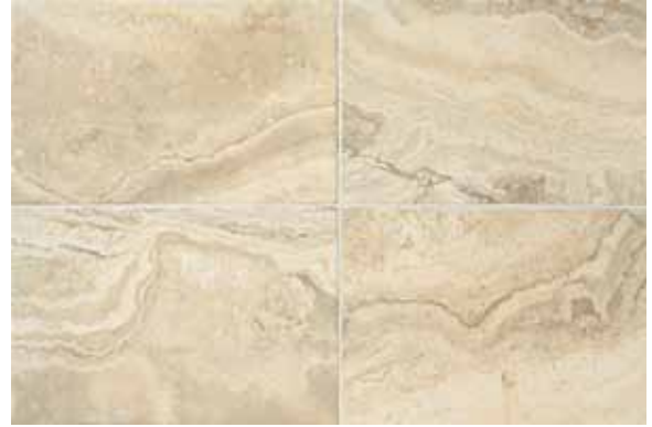
TUSCAN SUN CR15