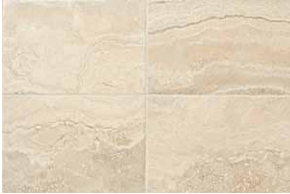
WHITE FLORA CR14