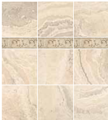
GRID PATTERN WITH ACCENT