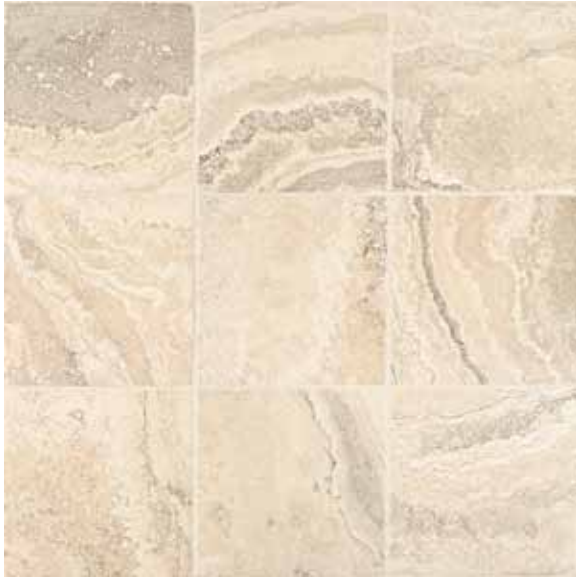
WHITE FLORA CR14