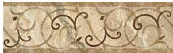
TUSCAN SUN CR15 4 x 13 Decorative Accent