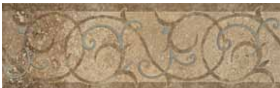
MEDITERRANEAN SAND CR16 4 x 13 Decorative Accent