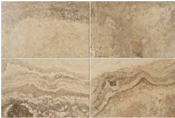
MEDITERRANEAN SAND CR16