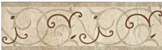
WHITE FLORA CR14 4 x 13 Decorative Accent