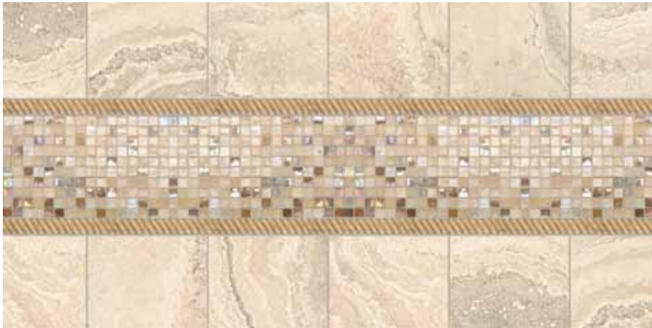
Backsplash features White Flora field tile with Cristallo Glass in Smoky Topaz 1 x 8 Rope Liner and City Lights in Paris 1/2 x 1/2 mosaic.