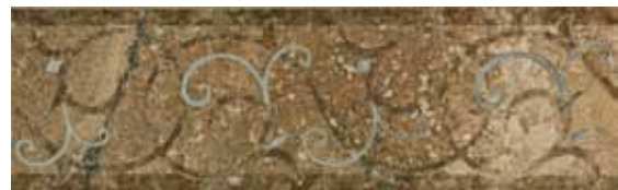
UMBRIAN HILL CR17 4 x 13 Decorative Accent