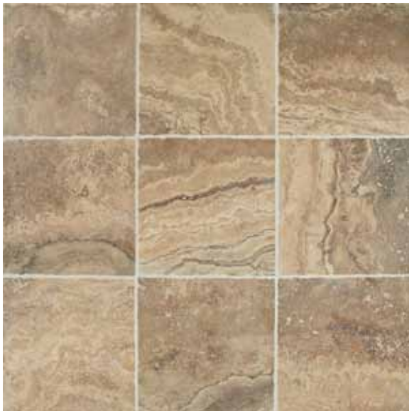
MEDITERRANEAN SAND CR16