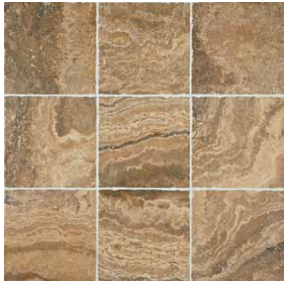
UMBRIAN HILL CR17