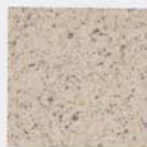
Buffstone Range D147 (1)