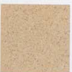
Mexican Sand™ Speckle D175 (2)