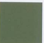
Juniper D322 (3)