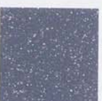
Galaxy Speckle D470 (3)