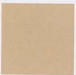
Mexican Sand™ D174 (2)