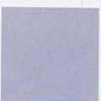
Bombay D178 (2)