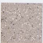
Dapple Gray D326 (2)