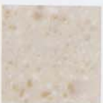
Marble D325 (2)