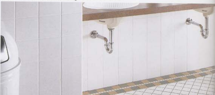
Photo features Keystones Select in Cypress, Mexican Sand and White with Keystones in 1" x 1" White. Wall features Semi-gloss in 6" x 6" White.