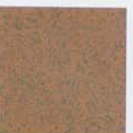
Cotto Speckle D179 (3)