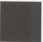
Ebony D311 (3)