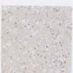
Pumice D336 (2)