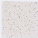
White Granite D037 (1)