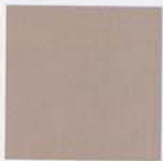
Dark Gray D026 (1)