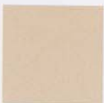
Fawn D136 (1)