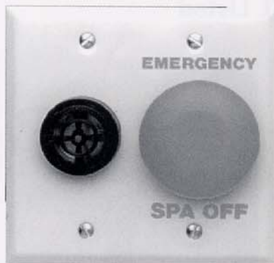
Emergency Shut-Off Switch with Alarm -- Included with Lx802.