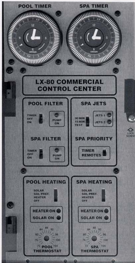
Lx80 Control Panel